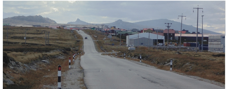
The “ring of hills” around Stanley. Tumbledown, Two Sisters, and Mount Kent, as seen from the Airport Road.

Ground Combat: When British and Argentine ground units occupy the same Camp, Ground Combat occurs. Each side totals its units’ Strength Points, and adds the result of one die roll. The side with the higher overall total wins the battle. If tied, the defender (the one already in the Camp) wins.